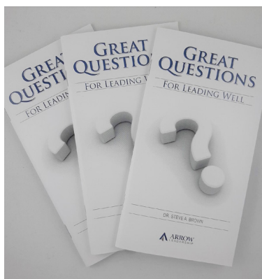
BOOK, BOOKLET Great Questions For Leading Well