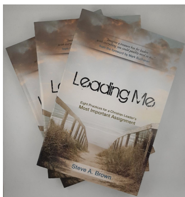
BOOK Leading Me