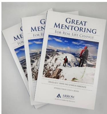
BOOK Great Mentoring for Real Life Change